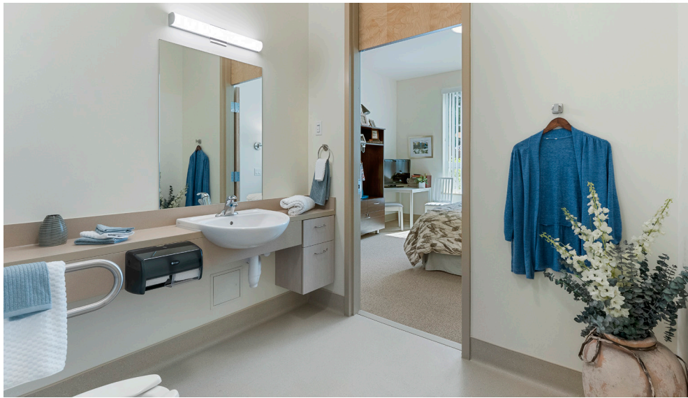
In suite bathroom