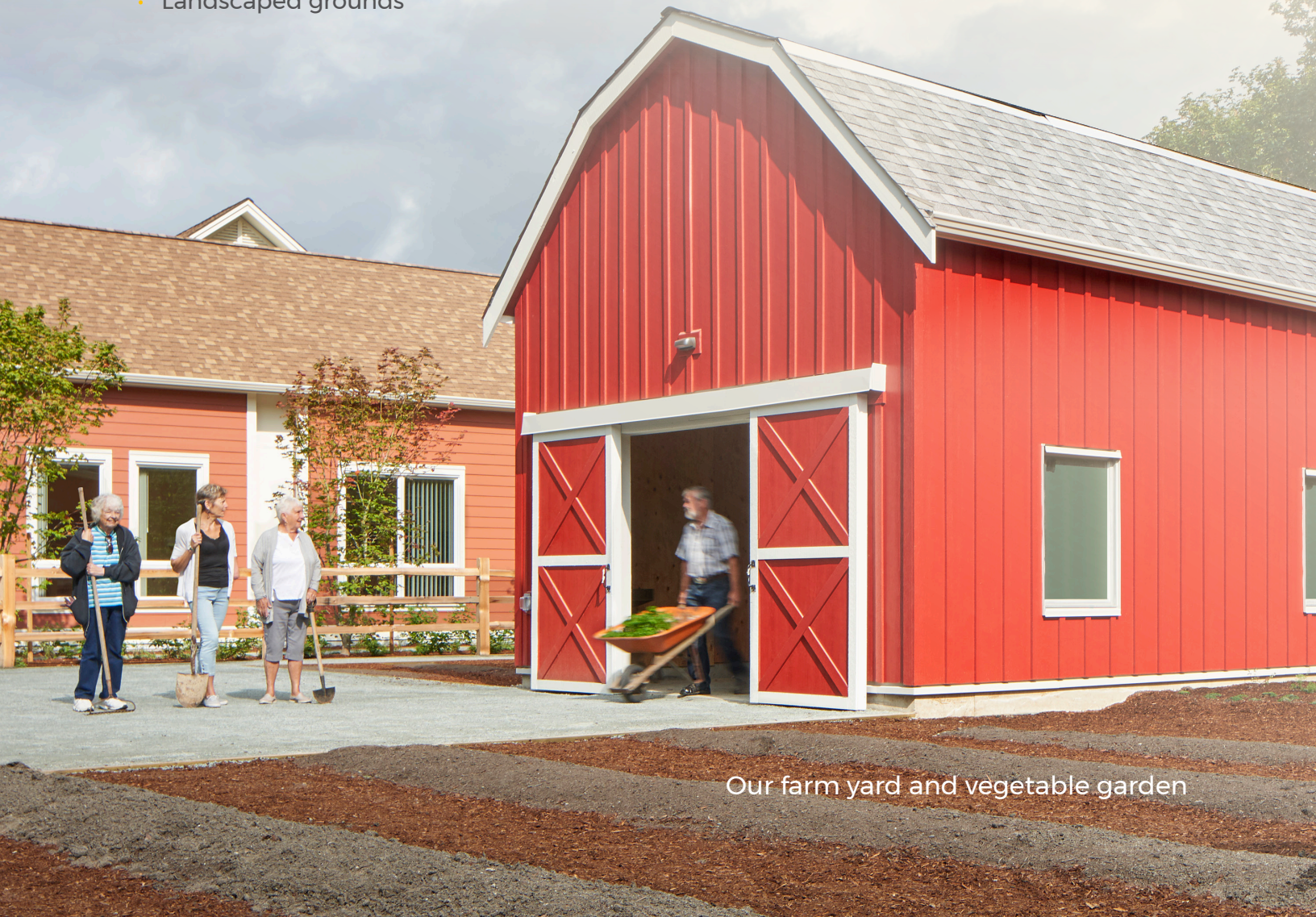
Our farm yard and vegetable garden