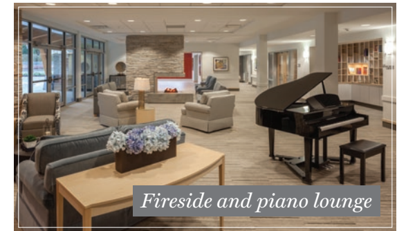
Fireside and piano lounge